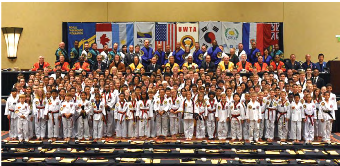
275 Black Belts participated in Examination in Reno.

The below listed Black Belts earned promotions to the designated ranks below. The official panel of Certified Examiners under the authority of the Kukkiwon conducted the examination on Friday, September 30, 2016 and found the below listed individuals qualified for promotion, having met all of the requirements and successfully passing their exam. Earning a Kukkiwon certificate is the highest certification available in the Taekwondo industry.