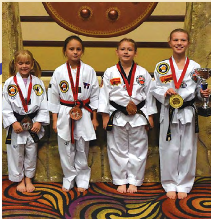
Girls National Championship Division.