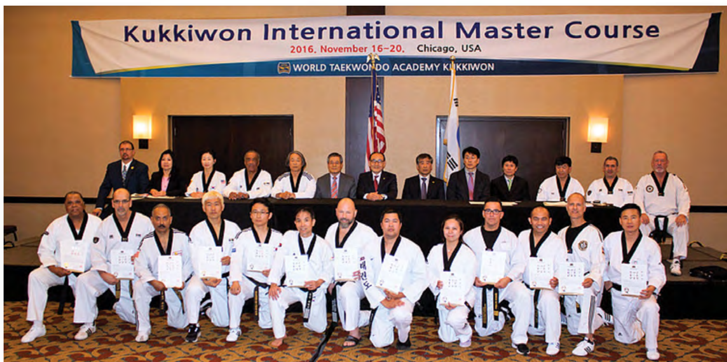
UWTa Seniors in Leadership Roles for Masters Course.